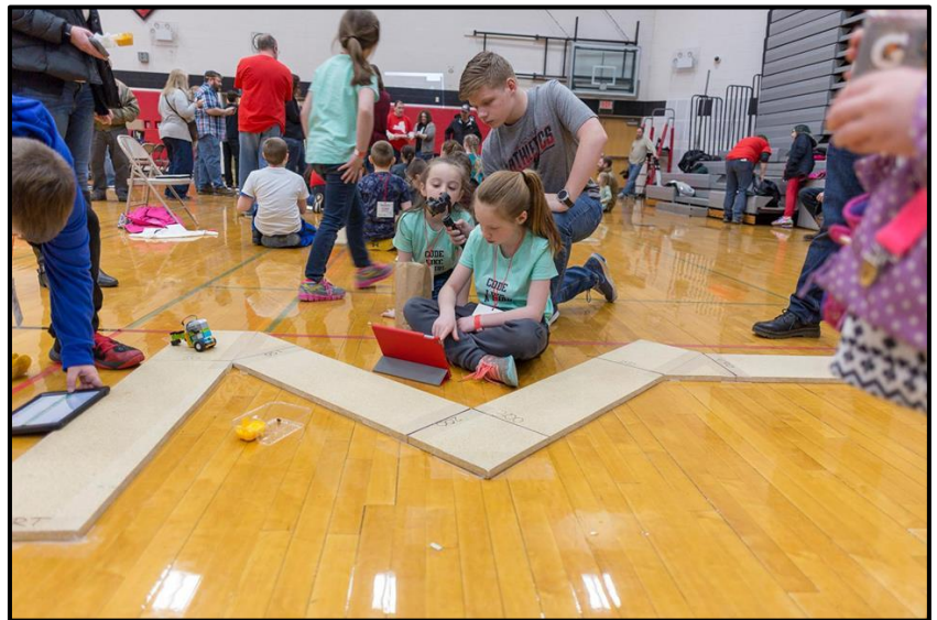
Photo 3: RoboRave event held in Oxford.

It took us less than 6 months to organize our first event at the Oxford school where over 40 teams composed of students from 2nd to 12th grade from schools in the region. All of this was done using some school resources, volunteers and donations from community sponsors. That event was held in April, 2018.